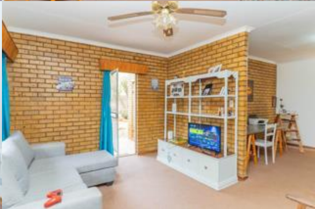
Miemiehof - Klerksdorp