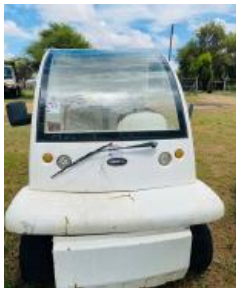
MELEX ELECTRIC GOLF CART