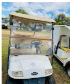
MELEX ELECTRIC GOLF CART