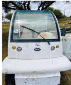
MELEX ELECTRIC GOLF CART