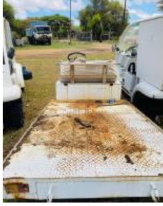
MELEX ELECTRIC GOLF CART